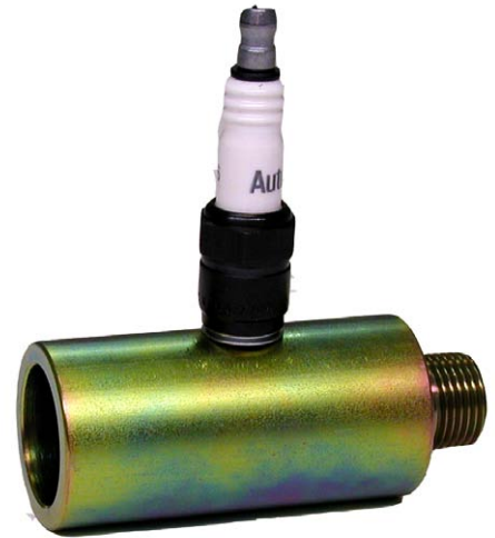
2BTS BLAST TIP

These tips, arranged on suitable pipe manifolds, or heads, may be used for roll heating, flame hardening, annealing, preheating, soldering, or other localized heating. Also for firing tin pots, varnish kettles, tanks, ovens, furnaces and numerous other types of equipment.