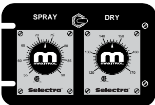
TD214B*, 55°-90°F, 120°-170°F Dual Temperature Dial with Switch in 4 x 6 enclosure.

Temperature control system with temperature range selection switch.