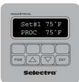
TDM01-A Digital Selector

Temperature control system utilizing a programmable microprocessor.