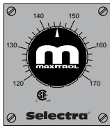
TD114 120°-170°F Dial