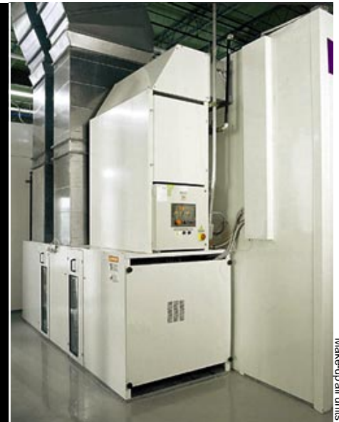
Make-up air units

A maximum of (4) setpoints can be programmed within a range of 50°F-300°F. Temperatures are set using up/down scroll buttons. The display is 2 line 16 character blue vacuum fluorescent. The display shows set and sensed temperatures simultaneously. Temperature sensing for all ranges is done with a single TS194Q sensor. Switching between the temperature ranges is accomplished by customer supplied switch. (Switch type dependent on the number of setpoints utilized).