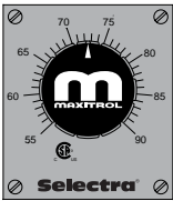
TD114 55°-90°F Dial