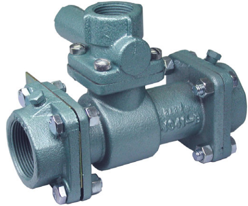
10-FMT MIXING TEE